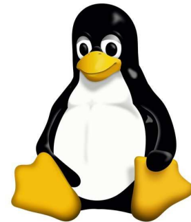
Figure 1 – The TUX penguin, Linux's mascot.

Over time, Linux has become the most popular system in the UNIX family.